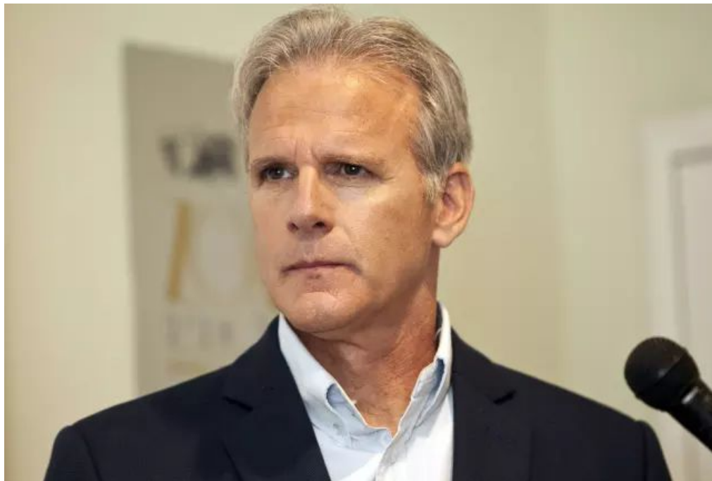
Historian and Kulanu MK Michael Oren: "Attempts to explain why Israel was interested

We use cookies to personalise content and ads, to provide social media features and to analyse our traffic. We also share information about your use of our site with our social media, advertising and analytics partners. Privacy Policy