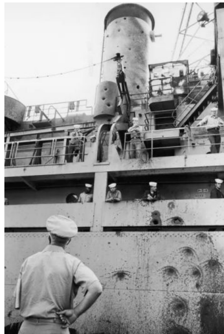
The technical research ship USS Liberty arrives at Valletta, Malta, having been attacked by Israeli aircraft and torpedo vessels in the Mediterranean, 8th June 1967.

A conspiracy? Healthy suspicion? Call it what you will. A new book published in May in the United States (its authors include several survivors of the attack) promises that “the truth is being told as never before and the real story revealed.” The 302 pages of “Remember the Liberty!: Almost Sunk by Treason on the High Seas” include quite a number of documents, testimonies, arguments and information that were gathered in the subsequent 50 years.